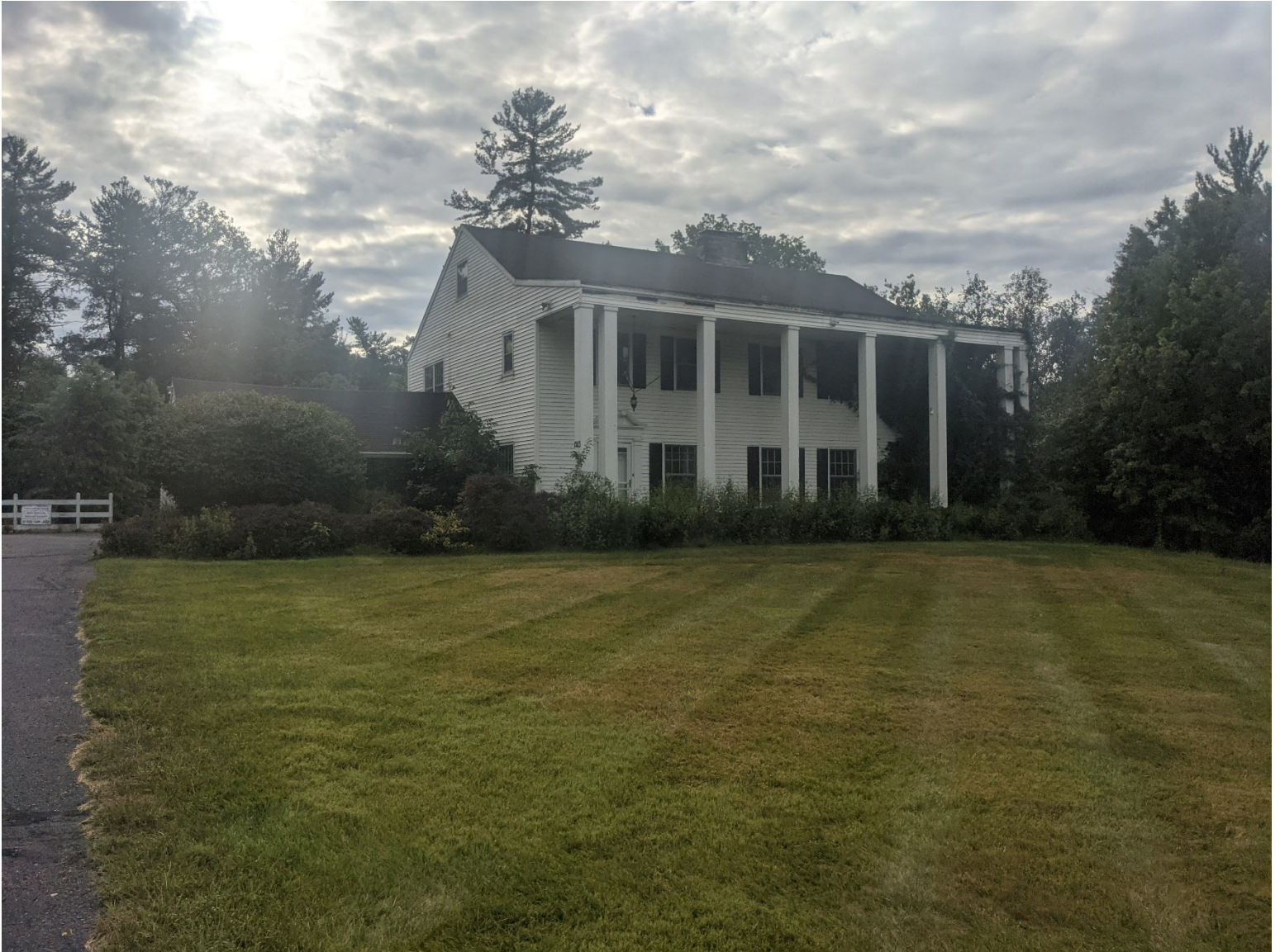
Image 1. Structure located at 1213 S. High Street, Bloomington to be used by the Bloomington Fire Department for live fire training purposes. Photograph taken by Brock Jones, IDEM OAQ, at the time of the inspection on August 21, 2021

REMAINDER OF PAGE LEFT BLANK INTENTIONALLY