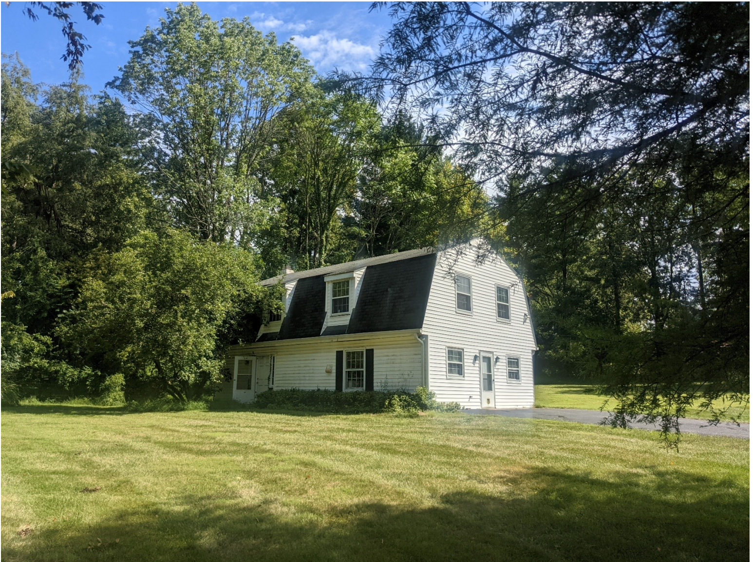
Image 2. Structure located at 1211 S. High Street, Bloomington to be used by the Bloomington Fire Department for live fire training purposes. Photograph taken by Brock Jones, IDEM OAQ, at the time of the inspection on August 21, 2021.