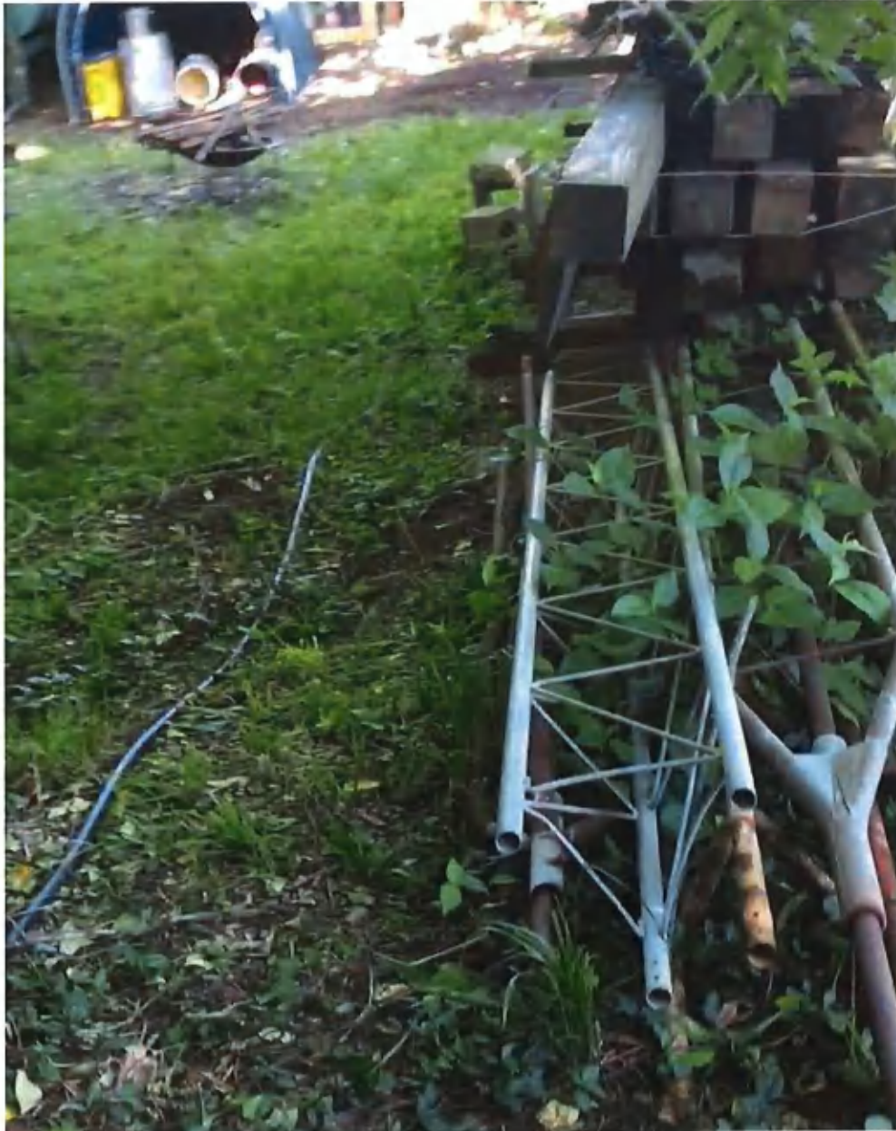
Photo 1: Outdoor storage of materials at 530 S. Washington Street on 06/23/2023.