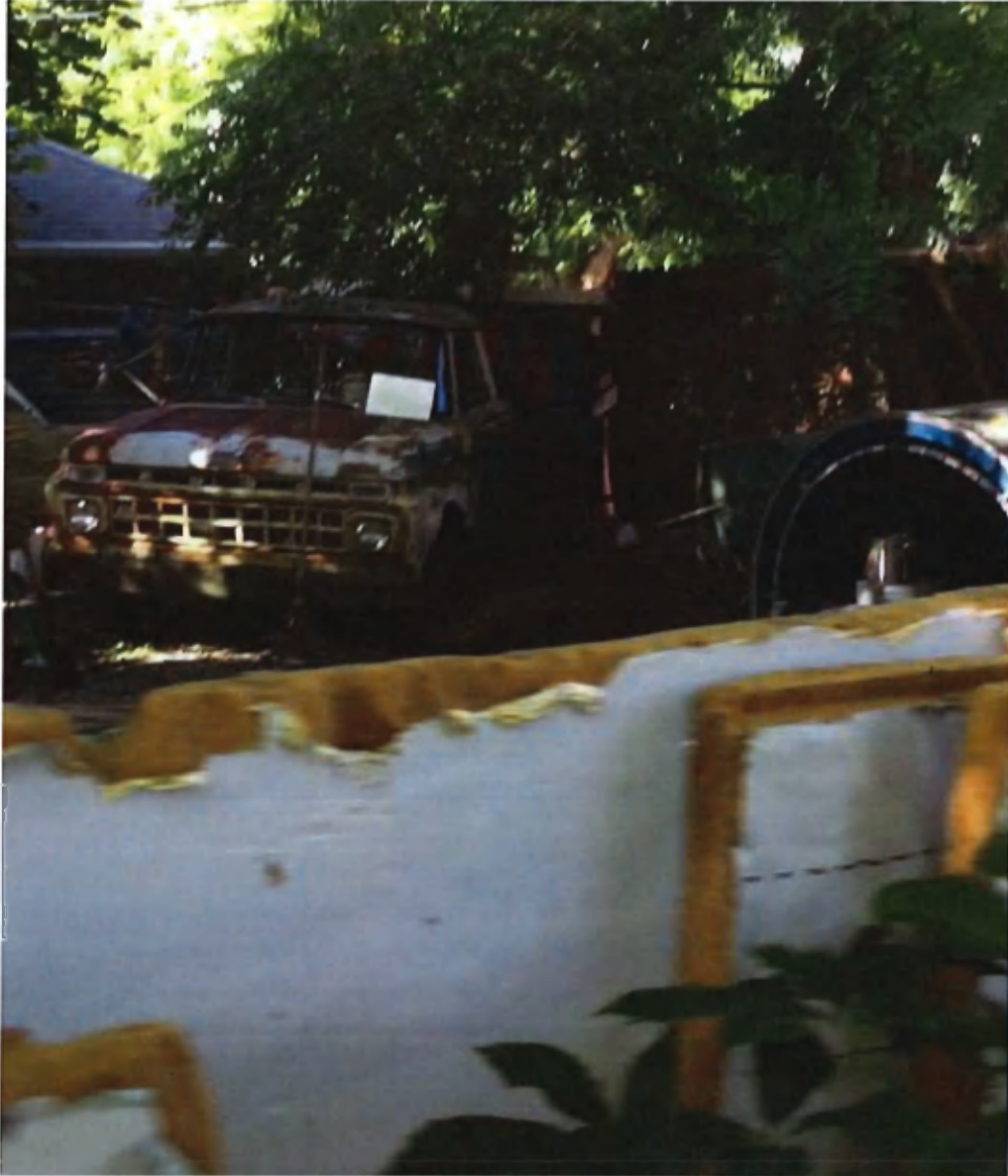
Photo 10: Outdoor storage of materials and parking on unimproved surface at 530 S. Washington Street on 06/23/2023.