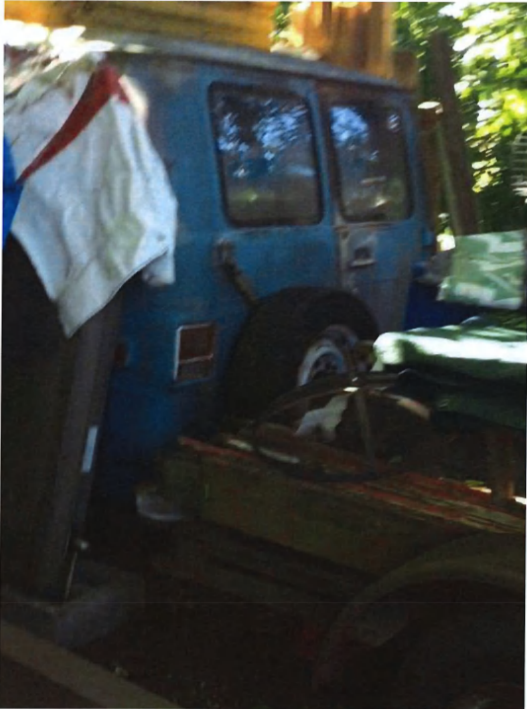
Photo 4: Outdoor storage of materials and parking on unimproved surface at 530 S. Washington Street on 06/23/2023.