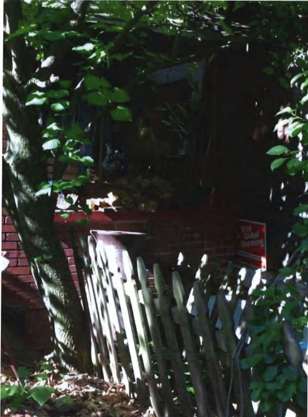
Photo 8: Outdoor storage of materials at 530 S. Washington Street on 06/23/2023.