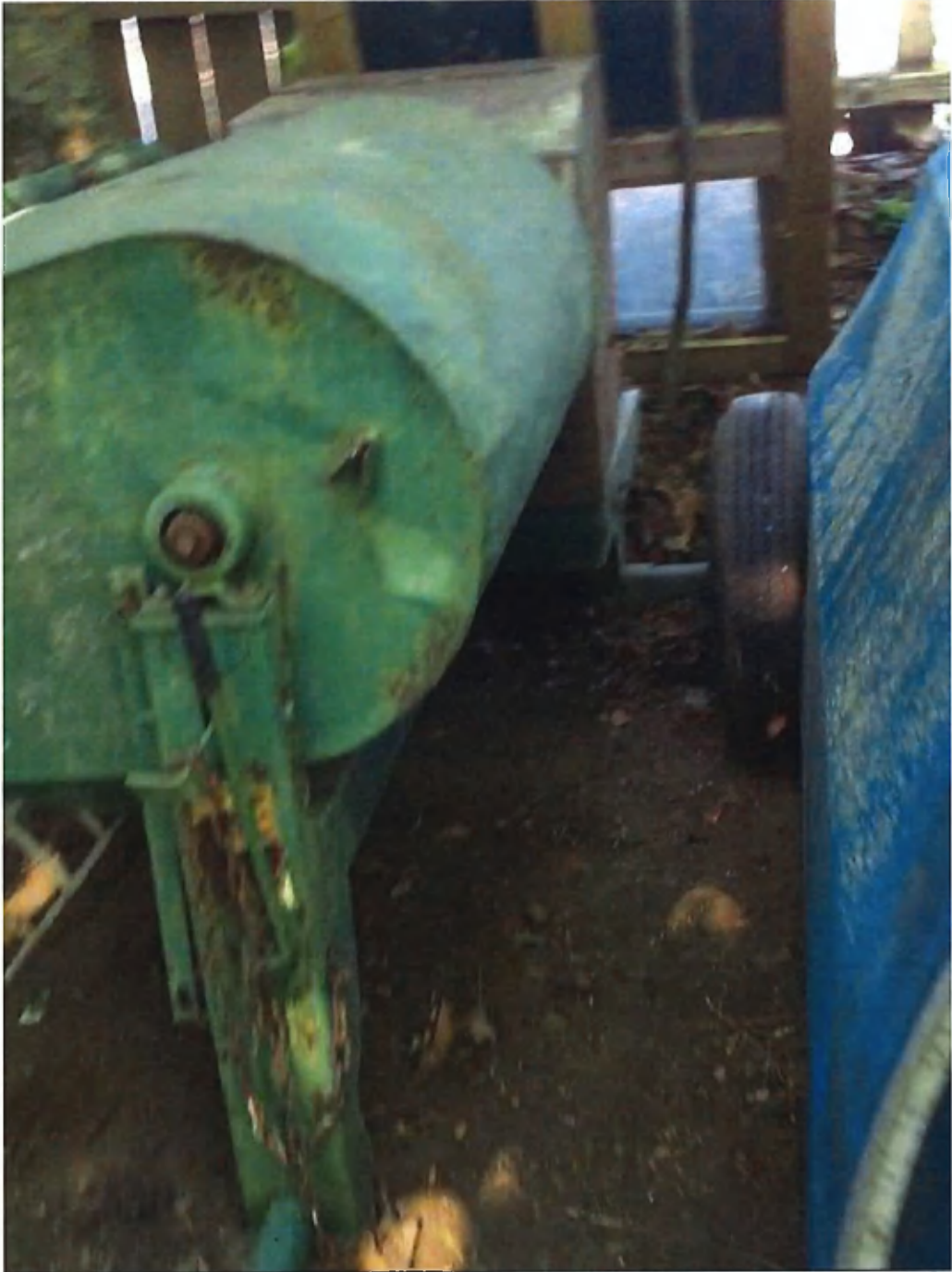
Photo 3: Outdoor storage of materials, specifically equipment, at 530 S. Washington Street on 06/23/2023.