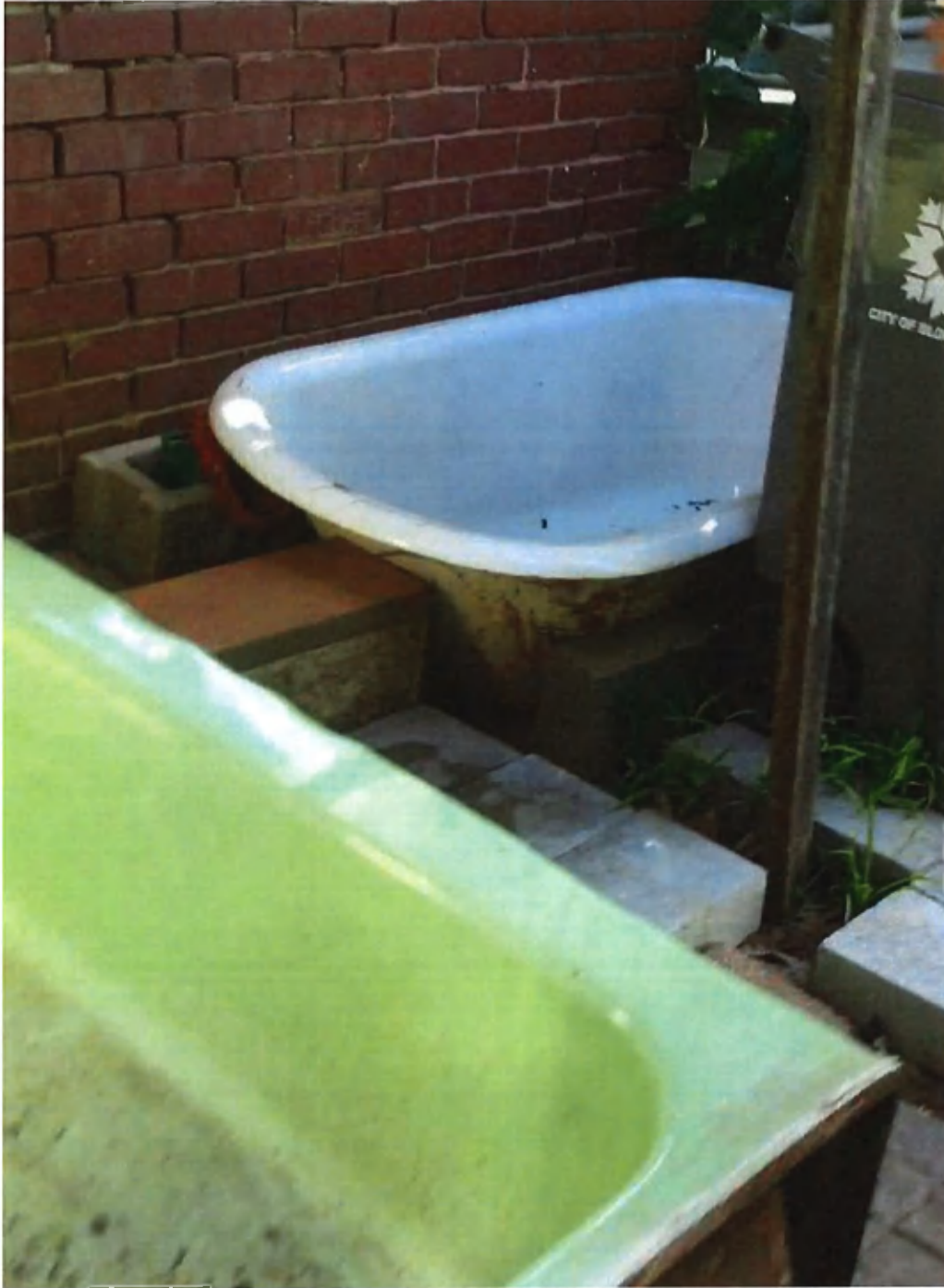
Photo 7: Outdoor storage of materials at 530 S. Washington Street on 06/23/2023.