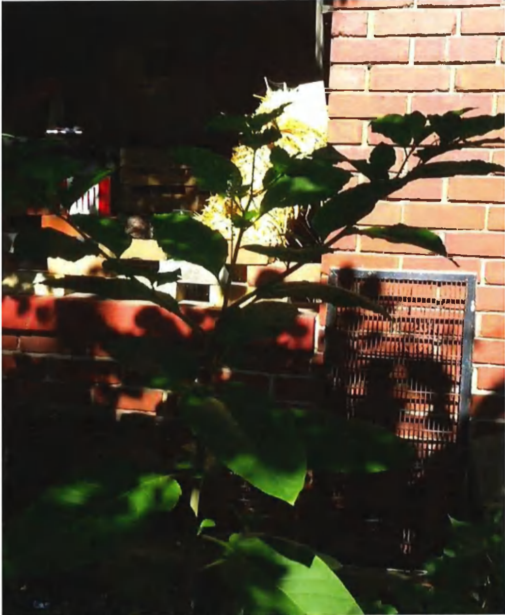
Photo 11: Outdoor storage of materials at 530 S. Washington Street on 06/23/2023.