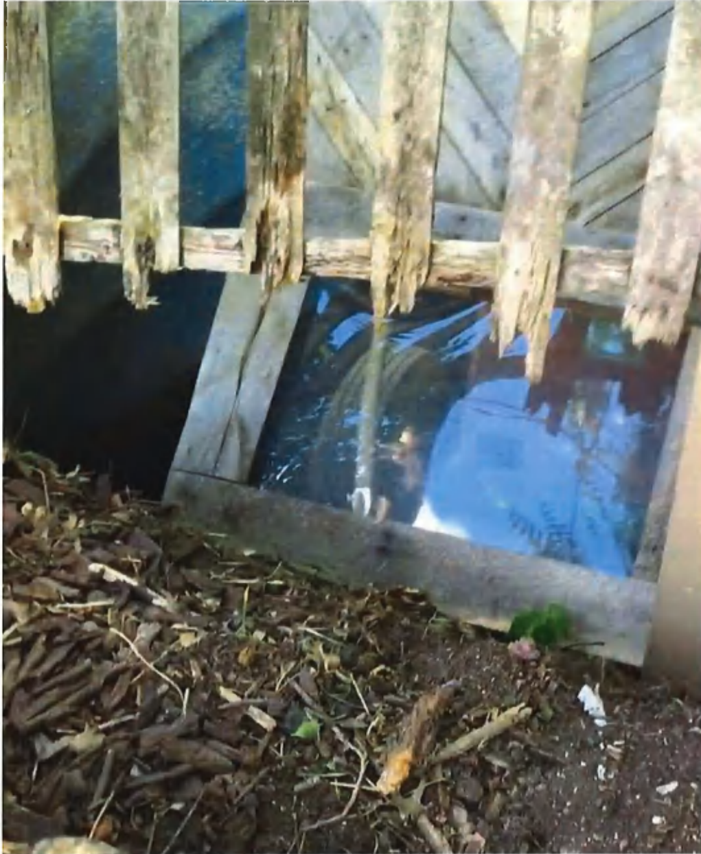
Photo 9: Outdoor storage of materials at 530 S. Washington Street on 06/23/2023.