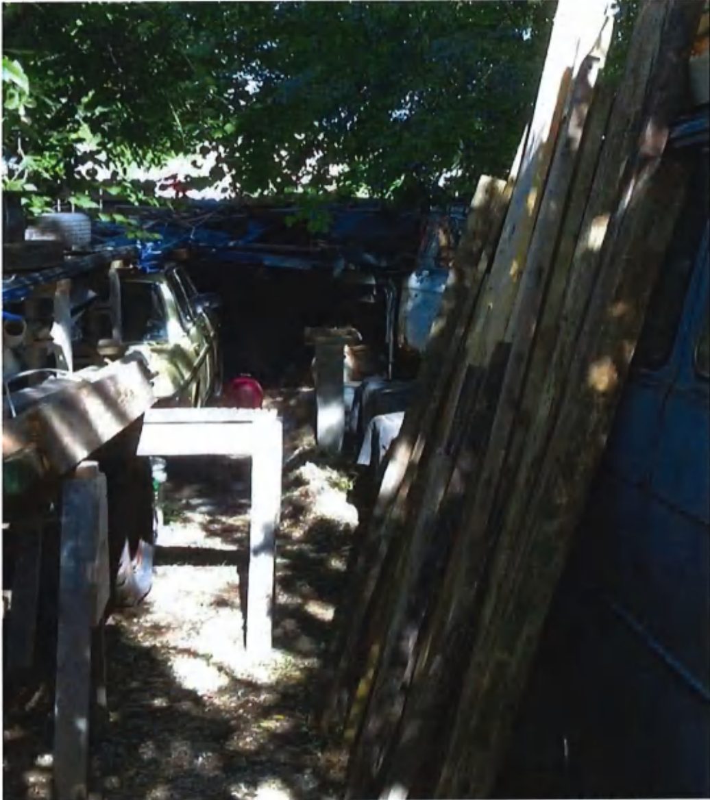
Photo 5: Outdoor storage of materials and parking on unimproved surface at 530 S. Washington Street on 06/23/2023.