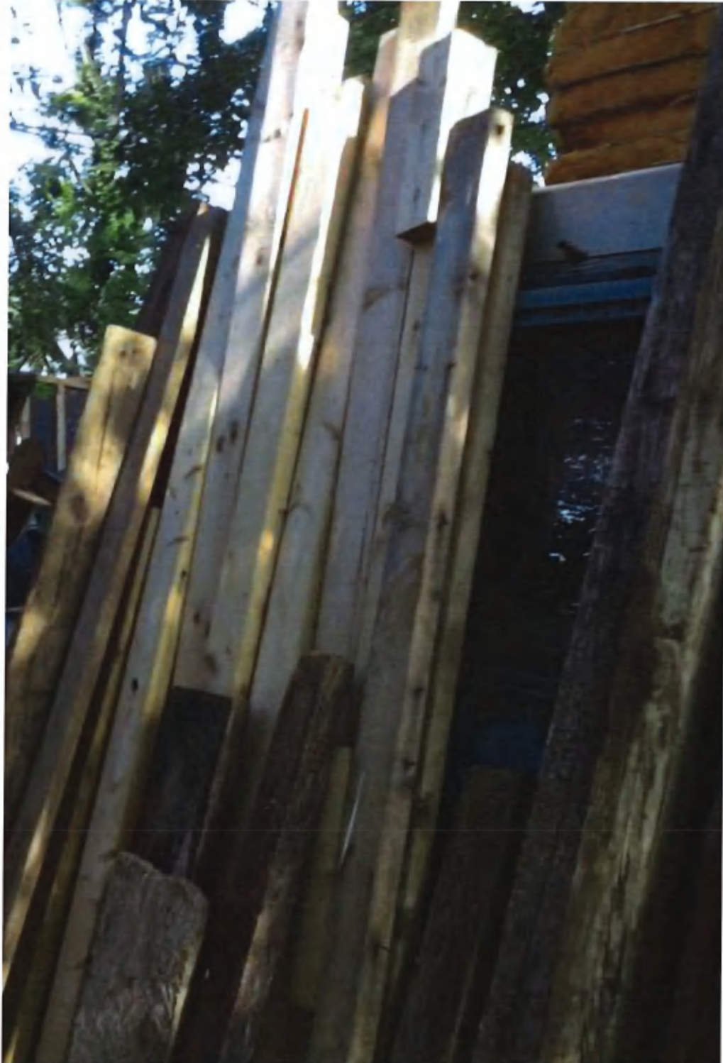
Photo 6: Outdoor storage of materials and parking on unimproved surface at 530 S. Washington Street on 06/23/2023.