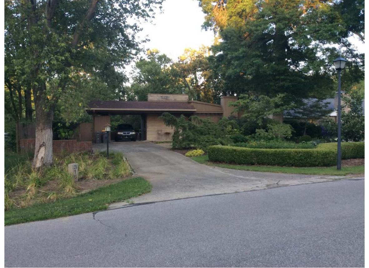
316 N Hillsdale Drive