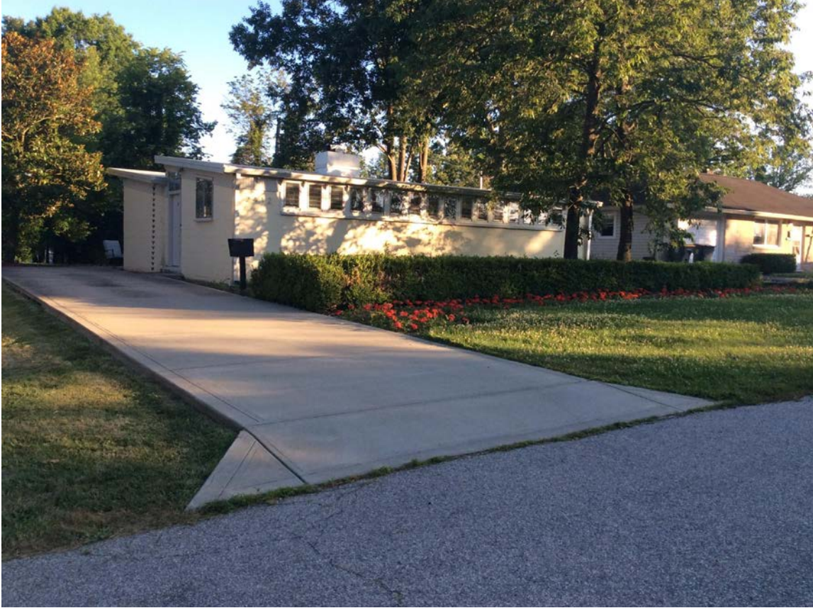
2412 E 4 th Street