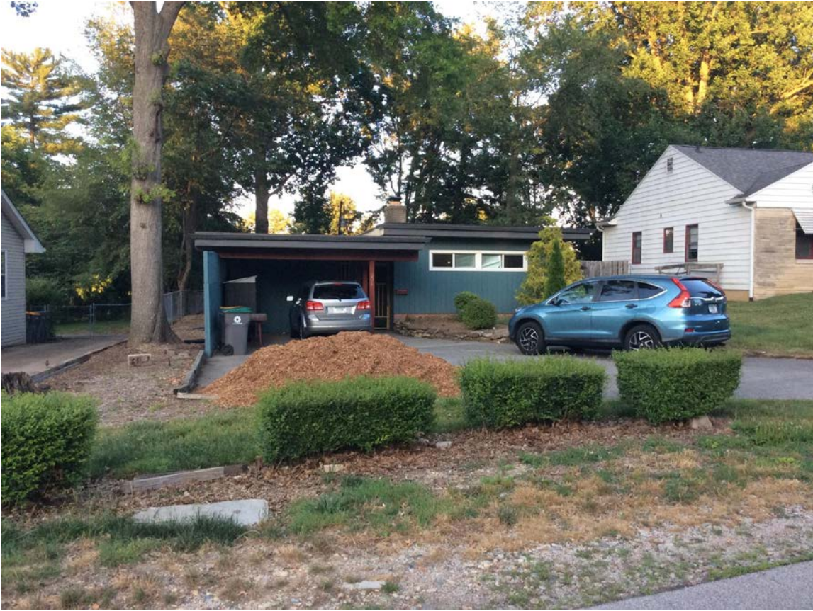
201 S. Hillsdale Drive