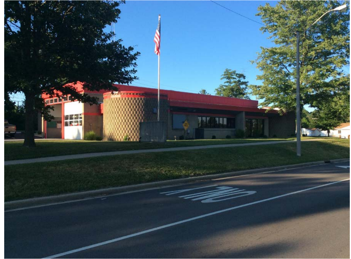
2201 E 3rd St